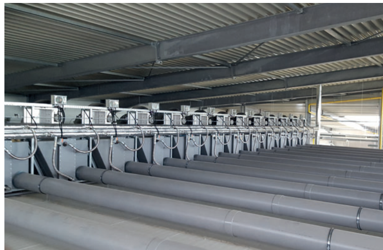
The system recognises any heat developments in the rack and compensates for them

Big-room chambers can be fitted out with this clever control system. The system recognises any heat developments in the rack and compensates for these by means of relevant ventilation profiles, heat output regulation and moisture addition. This means that, e.g., thick kerbstones can be placed in a neighbouring rack to thin terrace slabs without endangering the quality of either. As soon as the system has compensated for all differences, it switches itself into an energy saving mode to maintain operating costs at a minimum.