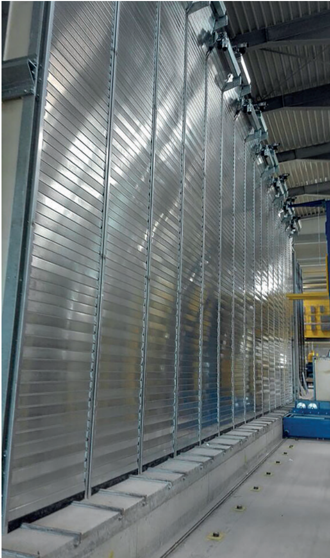
The entire system, including rack system, insulation and roller doors, was supplied and assembled by CureTec

CureTec supplies concrete curing systems for the concrete industry's entire range of products. The company also supplies racks, chamber insulation, doors, air circulation systems, aggregate heating units and water heating devices for mixing water. ■