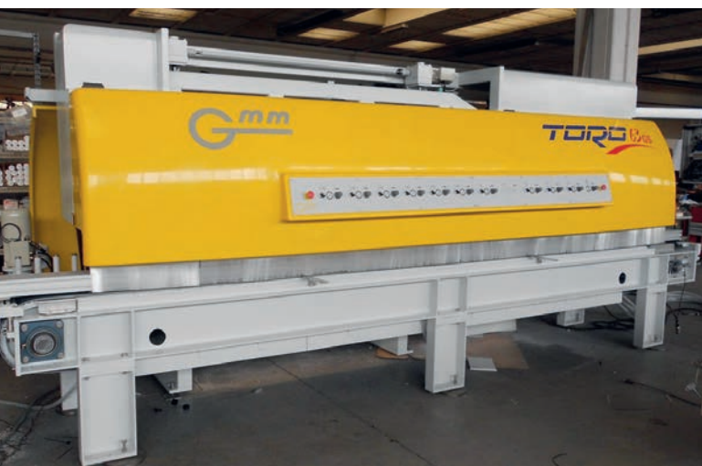
The Toro allows for high-speed finishing of chamfers, bull-nose, and other edge and end profiles while matching the finish of the LMS.