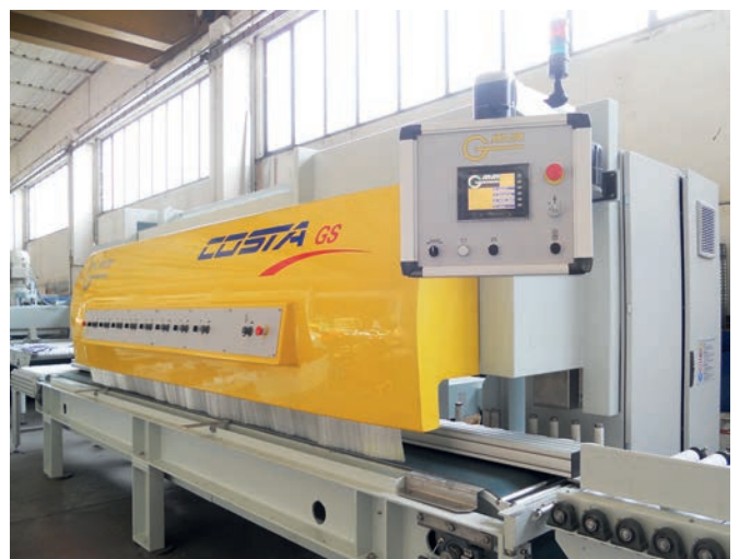
The Costa has a matching finish to the LMS as the solution to capacity demands while maintaining high efficiencies.